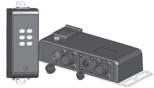
CVR100 Remote Control Sold Separately

Note: All cables provided are intended to be installed in only one direction. The cables are labeled as to direction (Front or Rear) or component they plug in to. Connections are made by either aligning the alignment marks on the connector or by aligning the connector keys.